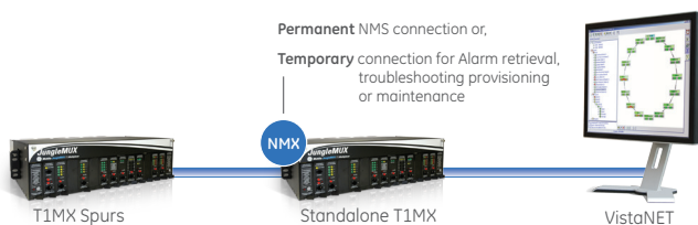
Fig. 2: Standalone T1MX networks can store alarms and events for later retrieval

NMX Units can also deliver SNMP traps to a 3rd party SNMP manager via VistaNET VSNNMP.