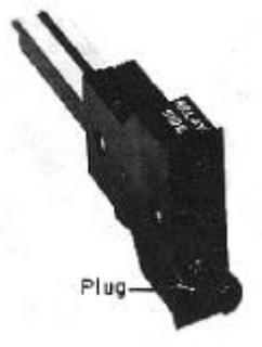
(Photo 8043264) Fig. 1. XCA11 test probe with shorting plug 0184B5461

The XCA28A1 is a full-width 14-position 28- point test plug which provides complete flexibility in testing C-case relays. See Figure 3. It has 28 electrically separate contact fingers connected to 14 concentric binding posts. One side of the test plug is prominent-