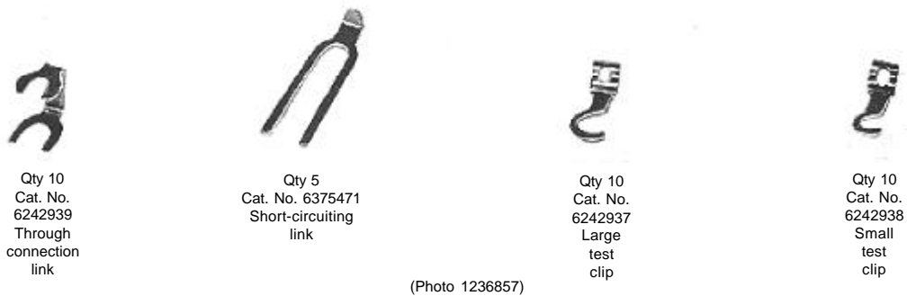
Fig. 4. Accessory links are provided with the test plug XCA28 for jumper connections and for connections to terminal studs

Accessory Link Kit = (10)-62422939P1 thru-links 273A9598G1 = (5)-6375471P1 short-circuit links (10)-6242937P1 test clip (10)-6242938P1 test clip